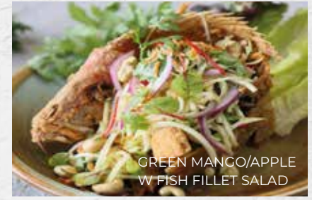
GREEN MANGO/APPLE W FISH FILLET SALAD