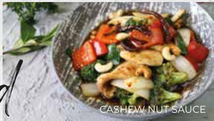
CASHEW NUT SAUCE