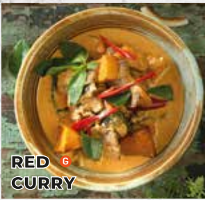
RED CURRY w. pumpkin and basil