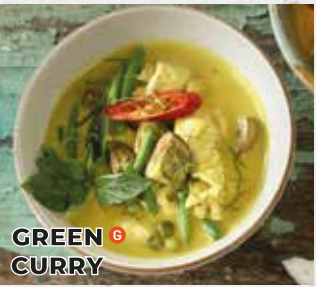
GREEN CURRY w. green beans, Thai eggplants, kaffir lime and basil