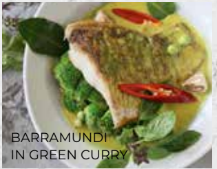
BARRAMUNDI IN GREEN CURRY