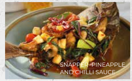
SNAPPER PINEAPPLE AND CHILLI SAUCE