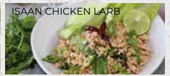
ISAAN CHICKEN LARB