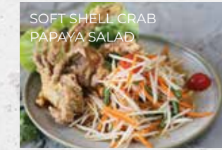
SOFT SHELL CRAB PAPAYA SALAD