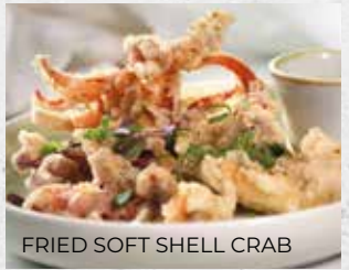
FRIED SOFT SHELL CRAB