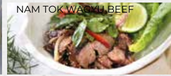
NAM TOK WAGYU BEEF