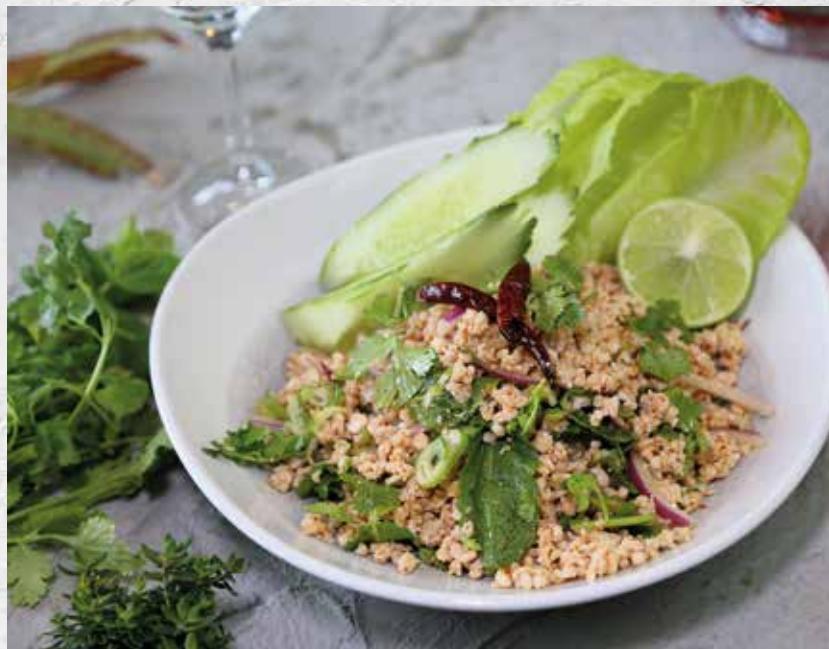
ISAAN CHICKEN LARB $19.9 w. onions, Thai herbs and chilli dressing