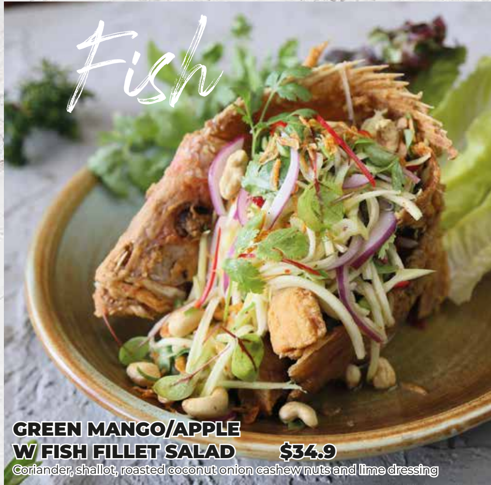
GREEN MANGO/APPLE W FISH FILLET SALAD $34.9

Coriander, shallot, roasted coconut onion cashew nuts and lime dressing