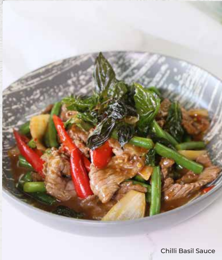
Chilli Basil Sauce