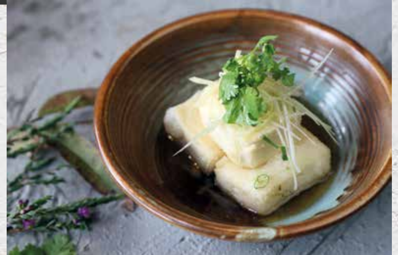
SILKEN TOFU $7.9 (3 PCS) in light ginger soy sauce