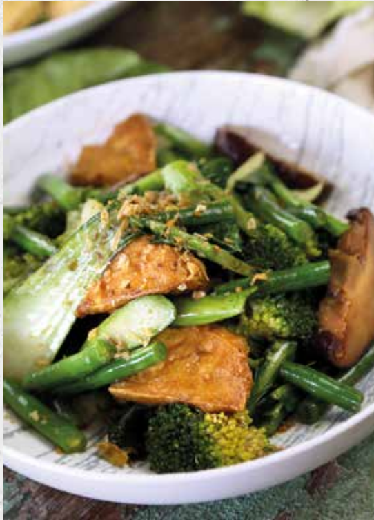
ASIAN GREEN STIR FRY $16.9