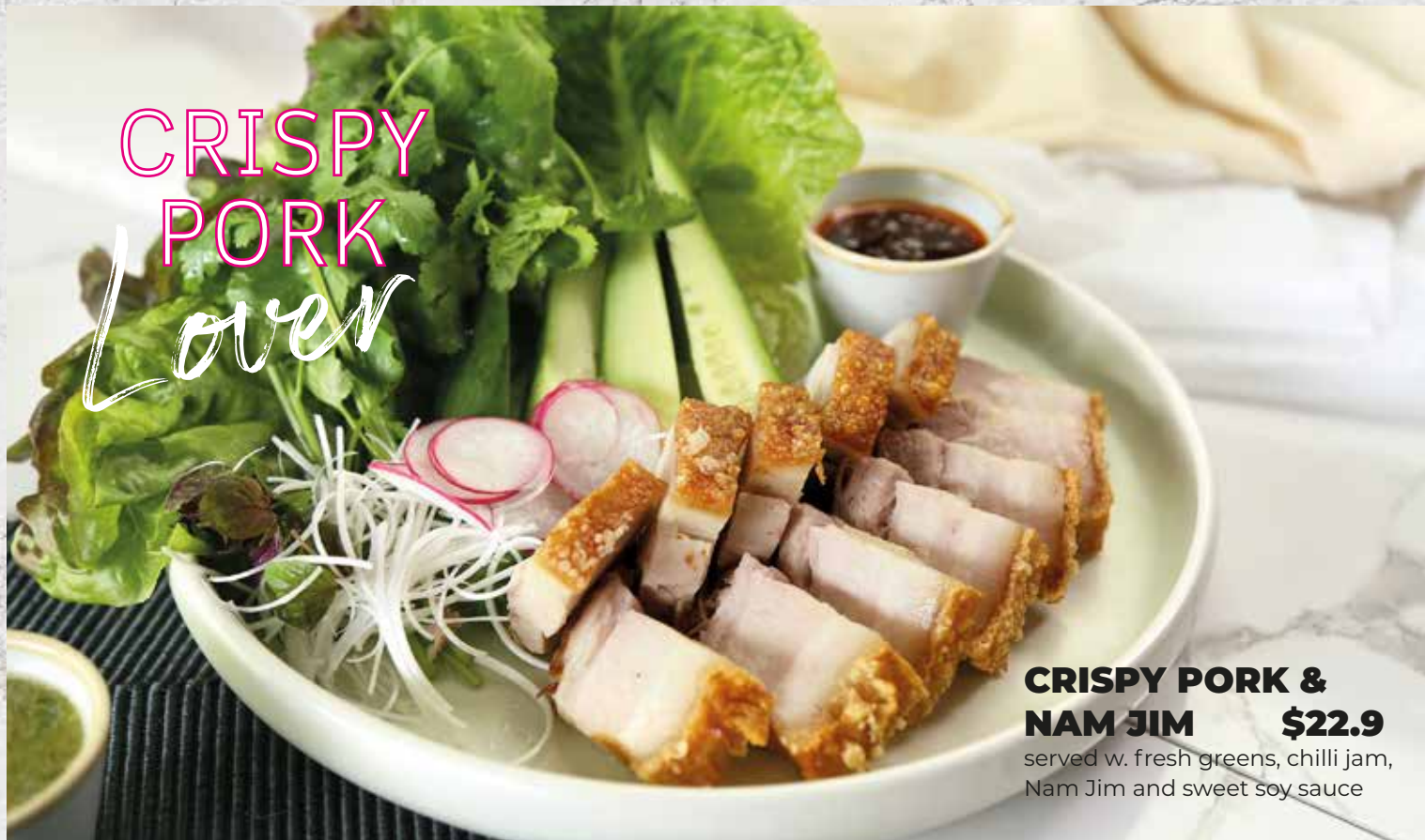
CRISPY PORK & NAM JIM $22.9 served w. fresh greens, chilli jam, Nam Jim and sweet soy sauce