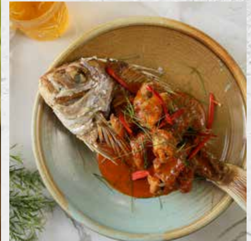
SNAPPER CHOO CHEE $34.9

Coriander, shallot, roasted coconut onion cashew nuts and lime dressing