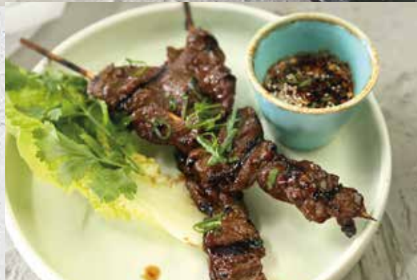
LAMB SKEWERS $7.9 (2 SKEWERS) w. Nam Jim Jeaw