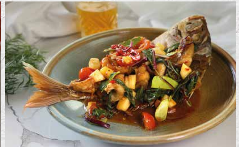
SNAPPER PINEAPPLE AND CHILLI SAUCE $34.9

fried snapper w. tomatoes, red onion and basil