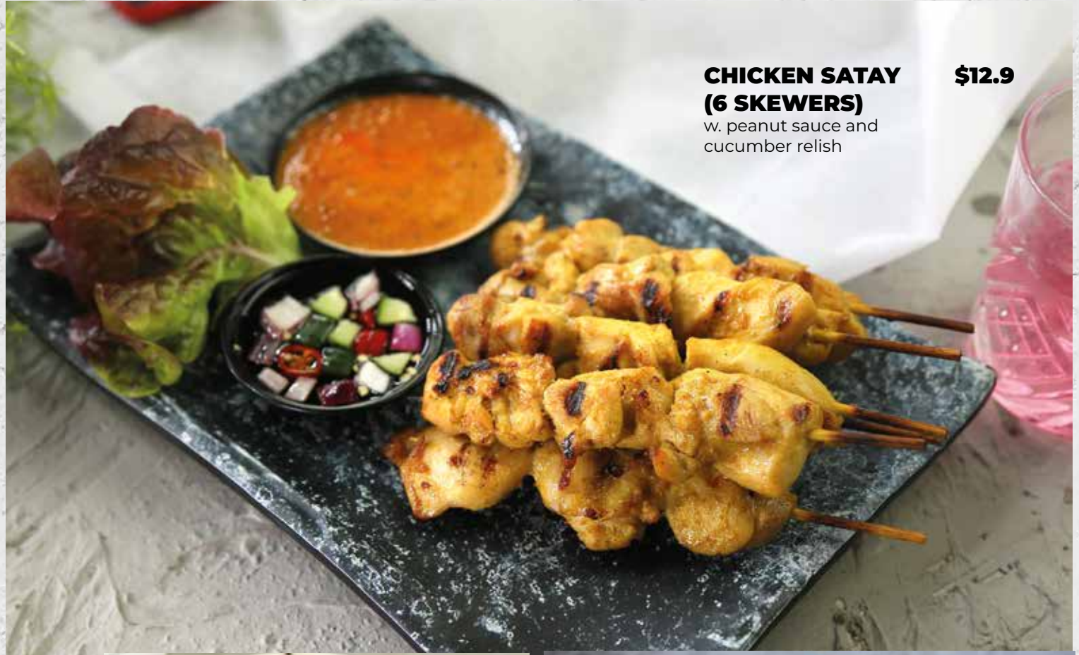
CHICKEN SATAY $12.9 (6 SKEWERS) w. peanut sauce and cucumber relish