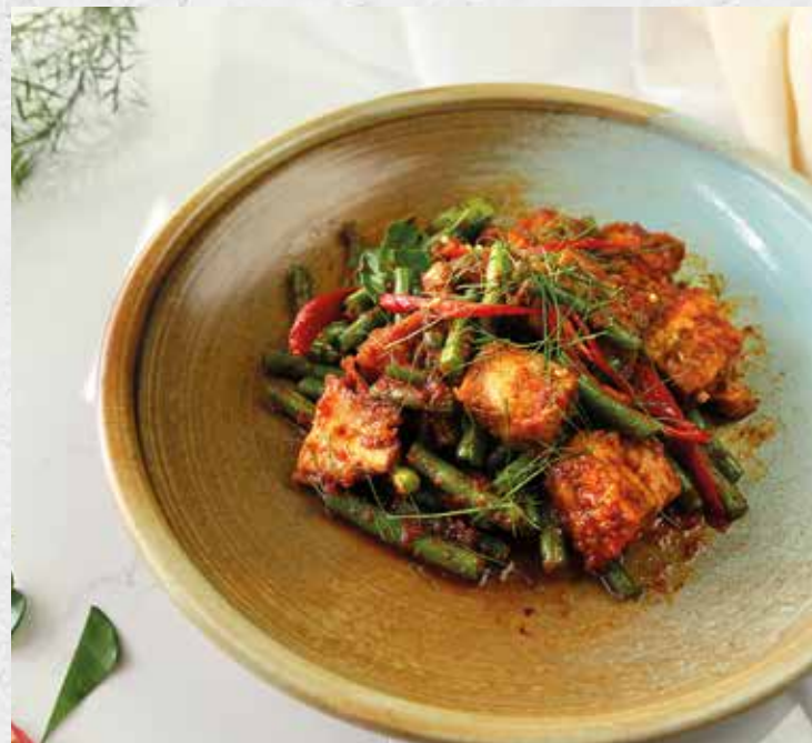
PRIK KHING CRISPY PORK $19.9 wok-fried w. green beans and kaffir lime leaves