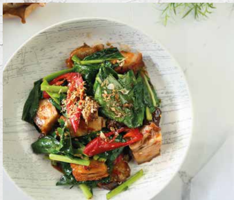
CHINESE BROCCOLI $19.9 w. CRISPY PORK wok-fried with chilli and soy sauce