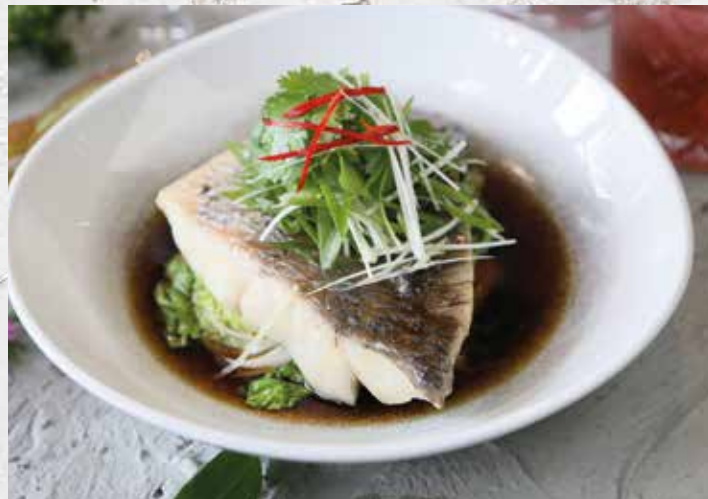
STEAMED WILD BARRAMUNDI W GINGER SOY SAUCE $28.9